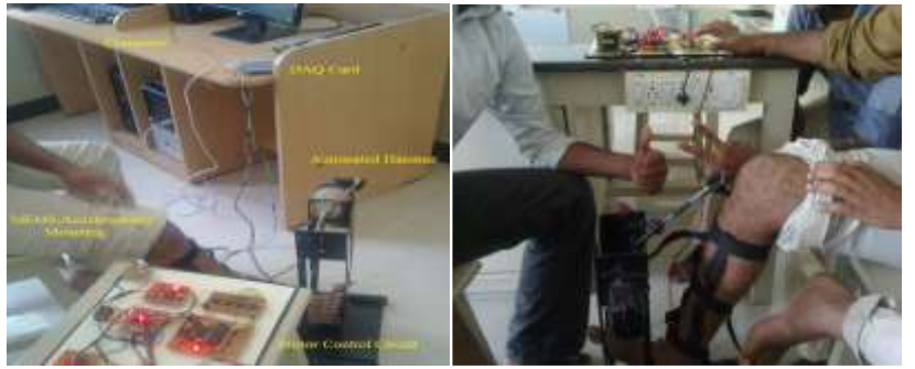
Camera view of the hardware setup